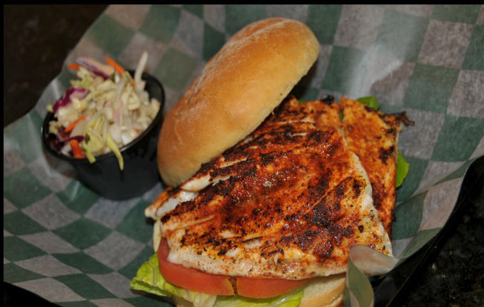
Blackened Mahi-Mahi Sandwich

This information is not intended as an offer to sell, or the solicitation of an offer to buy a Tin Fish Restaurant franchise. It is for information purposes only. *The figures below are Target Average Numbers and Operating costs only and based off of a Tin Fish standard 2400 square foot restaurant.