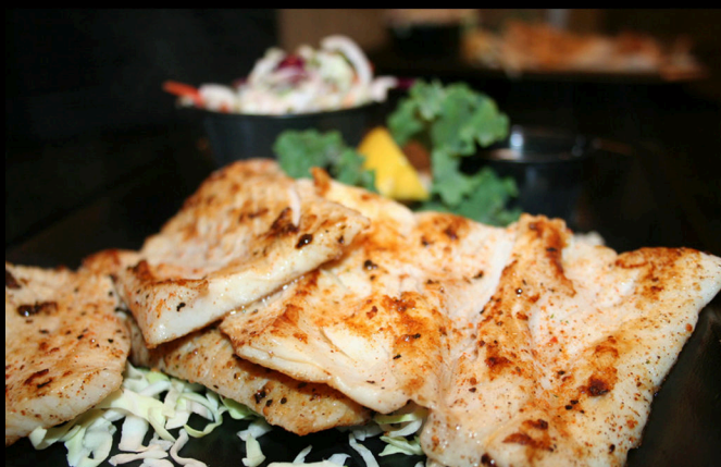
Grilled Salmon on Fresh Cabbage