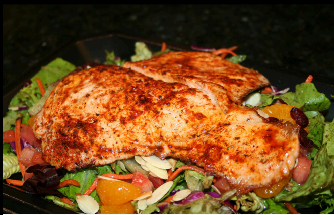
Fresh House Salad/Blankened Tilapia