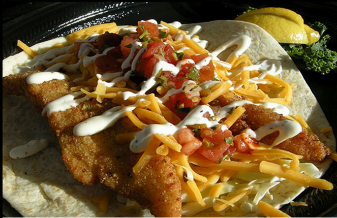
Award Winning Fish Taco