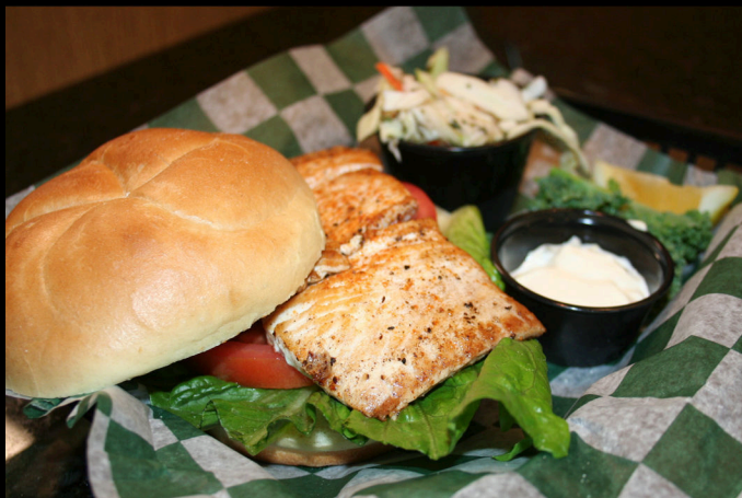
Grilled Salmon Sandwich