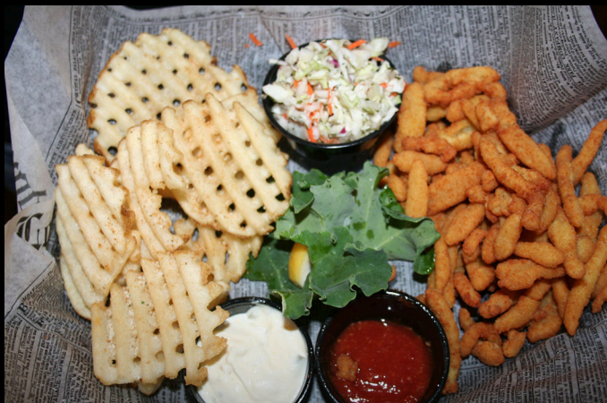
Lightly Breaded Clam Strips