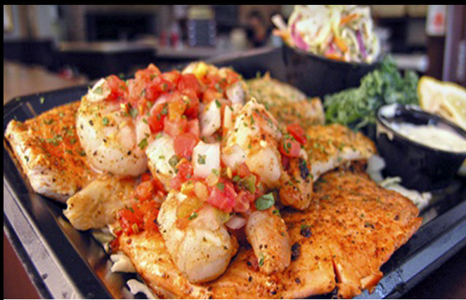
Grilled Mahi & Shrimp Plate